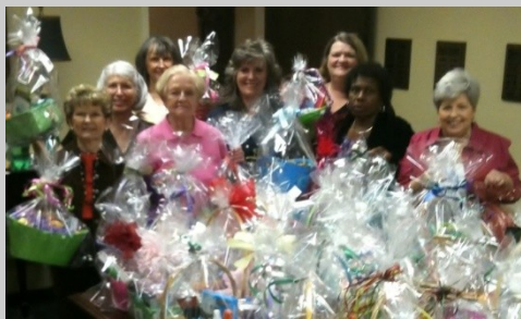
The ACW, Anglican Church Women, of Holy Cross Anglican Church, Loganville, GA ministered to teen boys and girls of DCFS, Dept. of Children & Family Services, by making 86 Easter baskets full of goodies and Bible verses this Easter. (above)