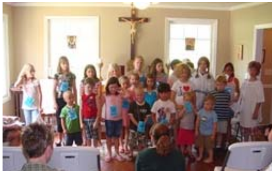
Vacation Bible School at St. Pat- rick's Angli- can Church, Smyrna, Tennessee