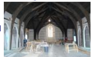
Christ Church, Montgomery, AL new construction