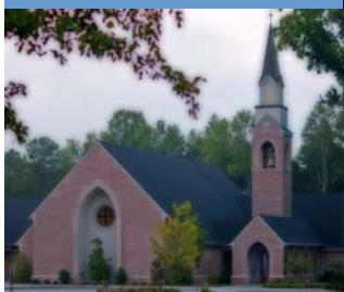
Holy Cross Anglican Church, Loganville, Georgia will be the site of the Anglican Diocese of the South's inaugural Synod April 30-May 1

The Anglican Diocese of the South exists to equip clergy and congregations to fulfill the Great Commandment (Mark 12:29-31) and the Great Commission (Matthew 28:19-20) by leading people into a growing relationship with Jesus Christ through personal discipleship, evangelism, and the nurturing and planting of congregations.