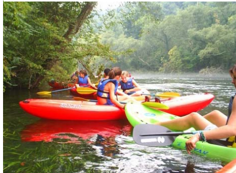
Church of the Holy Trinity, North Augusta, SC Youth