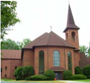
All Saints Anglican Church, Peachtree City, GA meets in this Methodist Church youth facility