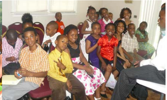
Children of Christ Anglican Church, Marietta, Georgia